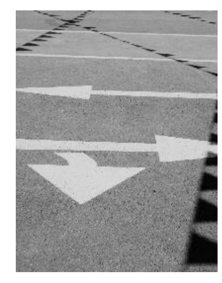
OPTIMUM USE OF PARKING