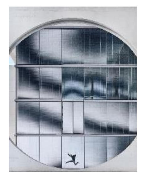
BETTER AIR QUALITY