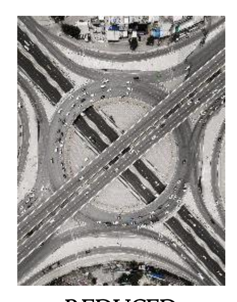
REDUCED TRAFFIC CONGESTION