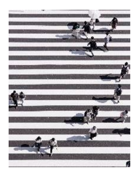
LESS NOISE POLLUTION