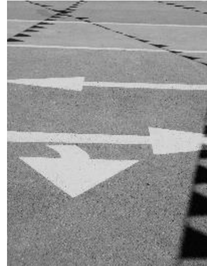
OPTIMUM USE OF PARKING