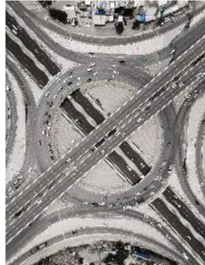
REDUCED TRAFFIC CONGESTION