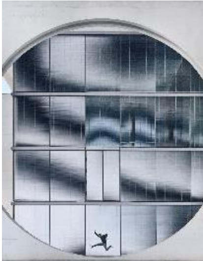
BETTER AIR QUALITY