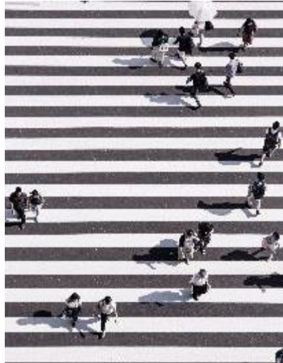
LESS NOISE POLLUTION